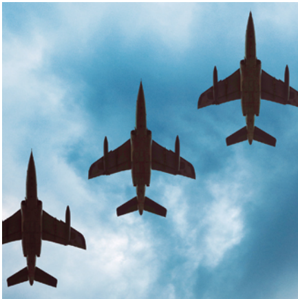
Performance soars with E850.